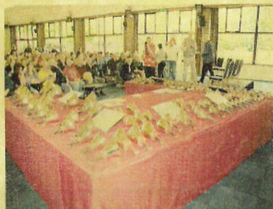
'Ringing World Roadshow' Coventry 2009

Should you require any further information about the Beverley Town Handbell Ringers please do not hesitate to contact our Secretary (Contact details on the back).