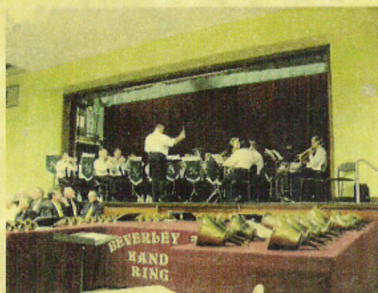
Joint concert with the 'Driffield Silver Band'

The band is also happy to participate in events shared with other groups.